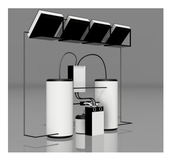
Fig 4- 3D model of solar water heater

conceptual. The complete setup made the solar water heater complete and different analyses have been carried out for the selection of components. The total design was carried out in Fusion 360 with the advancement features available in the CAD software.