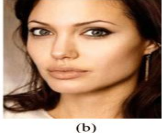
Fig- 3 : Image retouching forgery: a original, b retouched image[61]