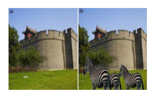
Fig- 1: Image splicing example where a is the authentic image, and b is the spliced image [60]

statistics that capture the correlations between the different subbands. To classify images based on these statistical features, supervised pattern classification is