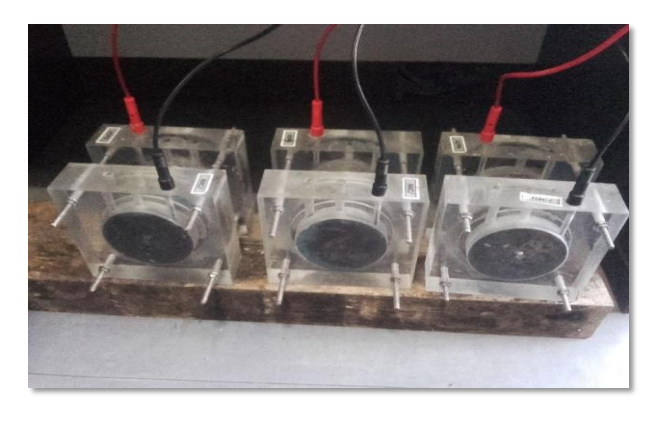
Fig -4: RCPT specimens