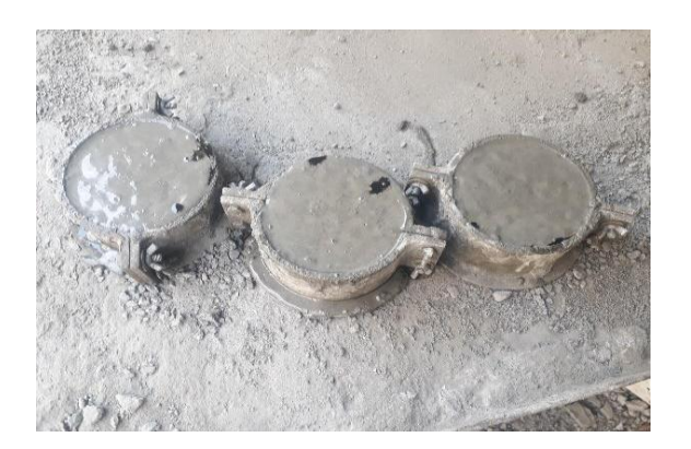
Fig -1: Casting of specimens

International Research Journal of Engineering and Technology (IRJET)e-ISSN: 2395-0056Volume: 09 Issue: 05 | May 2022www.irjet.netp-ISSN: 2395-0072