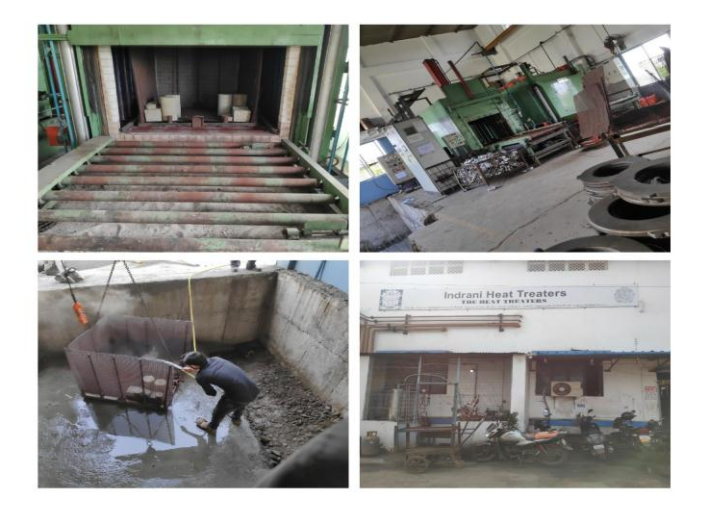
Fig -2 : Testing of specimens

The concrete specimens that have been drying for 24 hours have now been removed and placed into the furnace for heating at various temperatures. The concrete specimen heated for 200°c, 400°c, 600°c, 800°c. Through a boogie, the specimens are placed in the furnace, and the temperatures are set for the required time. When the target temperature is set, the furnace's coils on four sides heat the specimens through radiation. The furnace has two displays (a) set value display in which the temperature to heat the specimen is set in it and the temperature will be attained on the given time. (b) program value display which displays the temperature that is attained in the coil on the given time. The furnace will turn off once the temperature for the specified time has been reached. The specimens are then removed from the furnace and placed in a a closed area for air cooling.