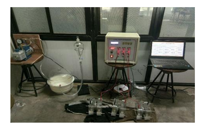
Fig -3: RCPT setup

We may compare the outcomes using the table above. The RCPT test is performed on a concrete specimen with the desired strength.