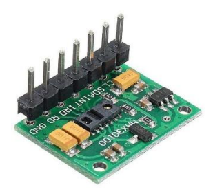
Fig-5: MAX 30100 Sensor

The MAX30100 is an integrated pulse oximetry and coronary heart rate monitor sensor solution. It combines two LEDs, an image detector, optimized optics, and low-noise analog signal processing to notice pulse oximetry and heart-rate signals. The MAX30100 operates from 1.8V and 3.3V electricity supplies and can be powered down via software program with negligible standby current, enabling the electricity supply to stay connected at all times. The MAX30100 is a whole pulse oximetry and coronary heart rate sensor device solution designed for the demanding necessities of wearable devices.