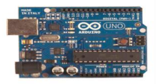
Fig-1: Arduino UNO

The Arduino Uno is a microcontroller board primarily based on the ATmega328. It has 14 digital input/output pins (of which 6 can be used as PWM outputs), 6 analog inputs, a sixteen MHz crystal oscillator, a USB connection, an electricity jack, an ICSP header, and a reset button. It carries the whole thing wished to assist the microcontroller; truly join it to a pc with a USB cable or electricity it with an AC-to-DC adapter or battery to get started. The Uno differs from all previous boards in that it does now not use the FTDI USB-toserial driver chip. Instead, it facets the Atmega8U2 programmed as a USB-to-serial converter. "Uno" capacity one in Italian and is named to mark the upcoming launch of Arduino 1.0. The Uno and version 1.0 will be the reference versions of Arduino, moving forward. The Uno is the latest in a series of USB Arduino boards, and the reference model for the Arduino platform; for a comparison with previous versions.