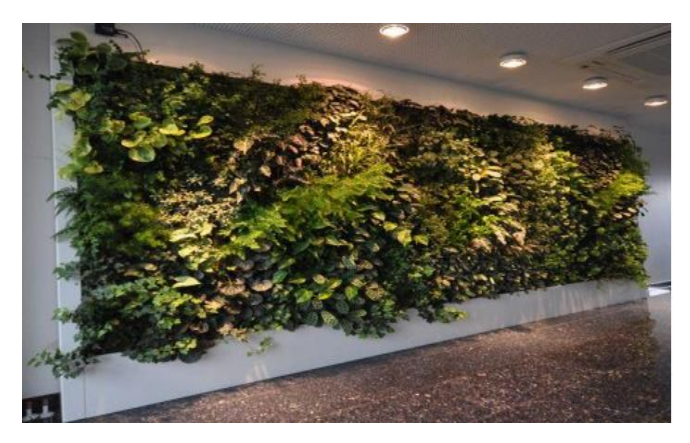
Fig -1: Vertical Gardening

Vertical Garden is a type of garden that grows upward (vertically) by the help of trellises or other support system rather than or the horizontal. The wall that is green walls or living walls are self-sufficient vertical garden that attach with either interior part or exterior part of building. This garden directly improves the beauty of garden and rapidly increase curb appeal by adding character, variety, structure and colour. Creating of eye candy by plantation at level of eye with vertical garden structure like hanging window boxes. Putting a green wall in buildings acts as fresher of air, balancing humidity levels. It improves both air quality indoor and outdoor by removing vertical compounds and also helps in absorbing the pollutants.