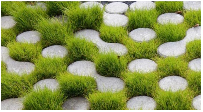
Fig -3: Grass Paves

It is the paving tiles which consists of number of rhombus shaped opening so that water can flow through ground and thereby helps in increasing the level of ground water. By using this product, it allows the water which is present at surface allows to seep into aggregate and that slows the runoff that would happen in asphalt surface. This paves primarily use in area where soil erosion occurs or drainage of water. It also helps in to stabilizes the soil in an area where lots of vehicular traffic may occur. It helps in controlling and containing the water pollution. It is a small sized area in which both side of building around 26 square meters of building. It is highly durable and use in driver way near the parking lot.