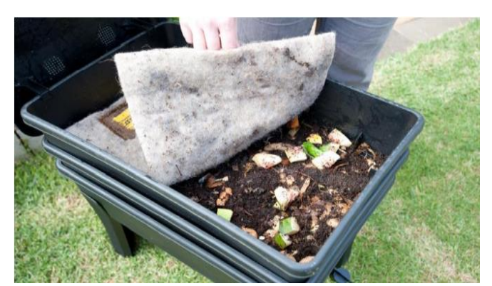
Fig -2 : Vermin Composting

It is the composting that is the end product of a process called vermin composting, which uses the earthworms. It increases the speed of composting process by improving the quality of compost. It is very essential what ends applied in garden. If we have to increase production capacity, solid waste that came from homes like food waste, raw waste, low dung etc. Ultimately the vermin composting results in rich, black earthy smelling composted that ensure the growth of health gardener. This cast vermin also known as worm casting is excrement of worm which minus the rest of compost. This plant is installed on black side of buildings which is in plot area. The area of plant includes about one meter wide, 1m length and 0.8m depth [3].