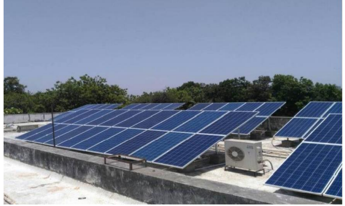
Fig -4: Solar Power Plant

• On grid or grid tie solar system – These are by far most common and wide use for homes and business property. These are basically use in systems that are connected to the public electricity grid and also requires battery storage. Any solar power that you generate by this system is exported onto electricity gride.