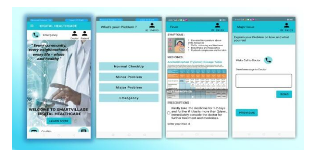
Fig-3: Mobile Application

We created a mobile application using JAVA in android studio to see the medical results from cloud.