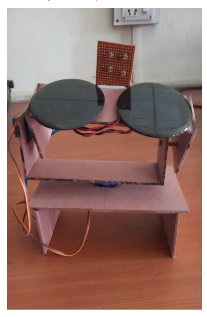
Fig. -2: Dual Axis Solar Tracking System

angle fixed. These systems, though they are more effective than fixed photovoltaic( PV) systems, does not use the available indispensable energy to maximum extent and has lower effectiveness compared to binary axis trackers.