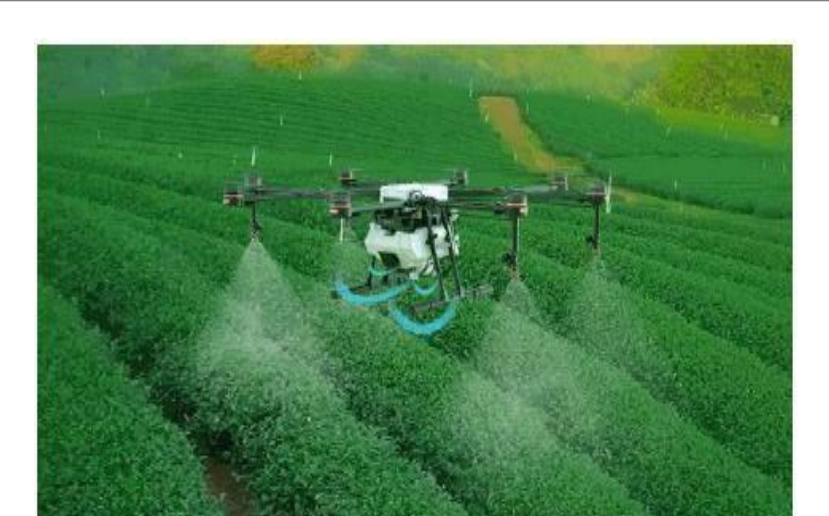
Fig 1. Crop monitoring using UAV

In the current year crop health monitoring is an important role in the agricultural sector. Diseases can be detected by UAV mounted on camera (Uncontrolled Air Vehicle). The UAV controlled by Transmitter Channel contains mode1 and mode 2.Crops should be monitored intelligently using the improve plant growth in fertilizer spray and pesticides based on crop damage.