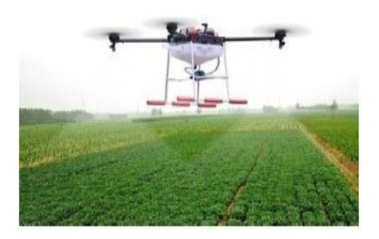
Fig 2: Pesticide spraying mechanism

Munmun Ghosal et al [5] developed a tracking system where air pollution is detected by a GPS module to determine longitude and latitude. This system monitors data using various sensors such as temperature sensor (LM35), humidity sensor (AM1001), MQ6 smoke, MQ135 CO2, LDRlight intensity, and GPS L80 for location tracking and Arduino board control. Factors considered are smoke, CO2, temperature, light intensity and humidity. The air quality indicator is monitored and displayed on a web server using an Apache server to determine the location where the contamination is noticeable and can be managed before a dangerous situation arises. It is a low cost and a more efficient model, therefore, can be concluded which can be used to monitor the spirit of small application.