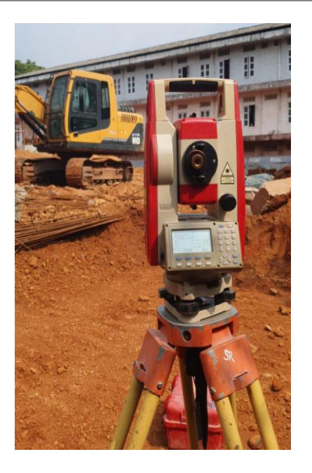
Figure 2: Total Station Surveying Equipment