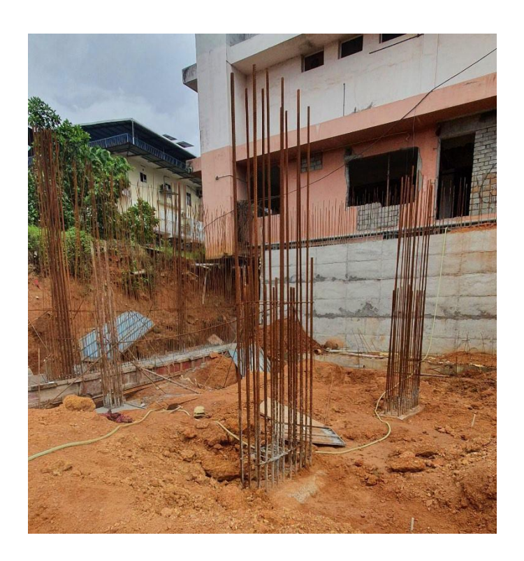
Figure 8: Completed Footing