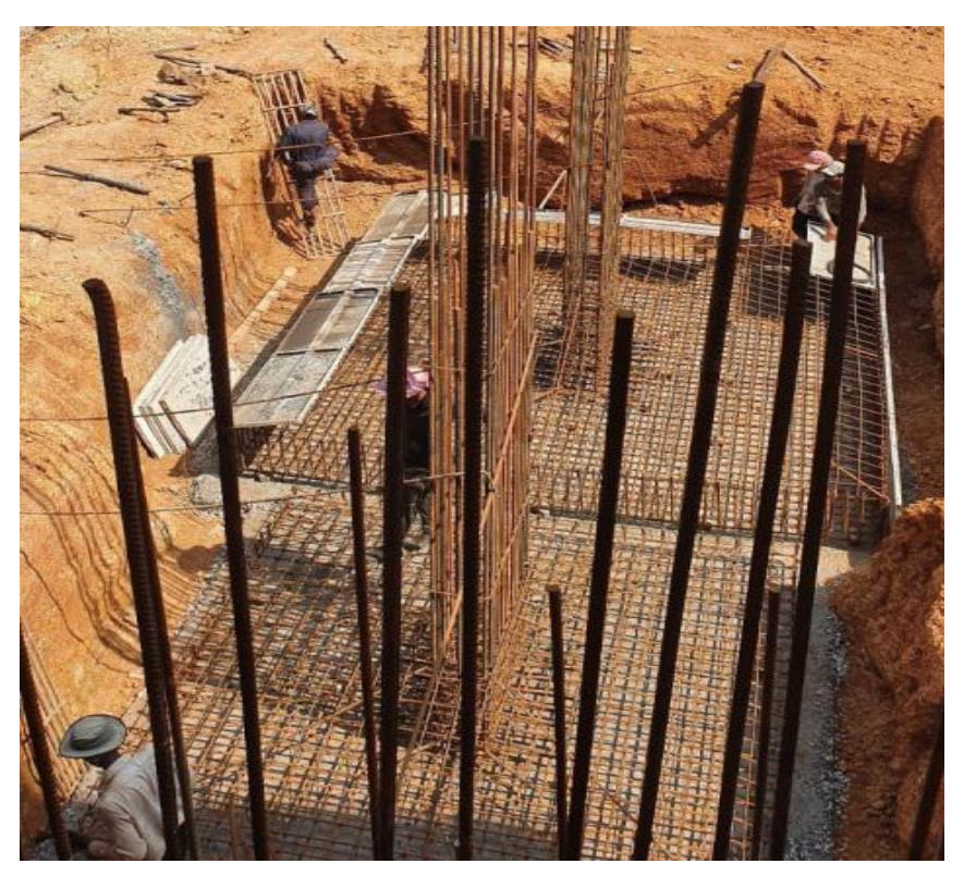
Figure 6: Laying reinforcement bars

It is most commonly used in construction for the footings in foundations. Its compressive and tensile strength means it can withstand the weight of a building being built up on it and the forces exerted by the weight of the structure and its live loads. The reinforcement bars were laid on top of the PCC. The concrete was mixed on site and pumped to the required point.