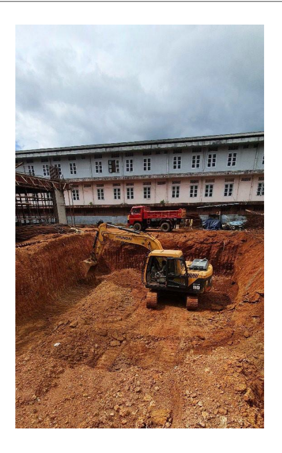
Figure 4: Land excavation using excavating machine