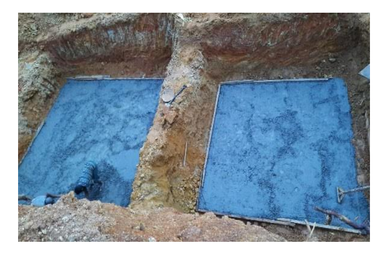
Figure 5: Placing PCC