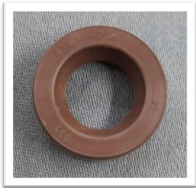
Fig -6: Shaft seal.

Shaft seal additionally referred to as oil seal, is a aspect assembly that sits across the shaft of the motor.