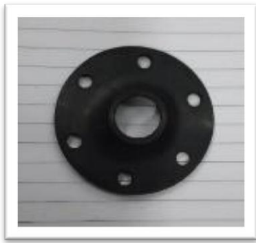
Fig -5: Rubber diaphragm.