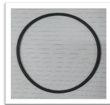
Fig -3: O-ring.

O-ring material are use for blower motor is rubber. O-ring are used to dam a direction which can also otherwise permit a liquid or water to break out. The O-ring is placed right into a groove to strong them in region, after which compressed amongst two surfaces