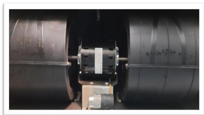
Fig -1: Blower motor.

This paper discusses blower motors with IP68 protection to be used in roof-mounted air-conditioned package devices for unique packages. This motor within the three phase AC electric powered motor. This utility is specifically hard because of factors that include environmental situations and voltage source instability. As a result, fantastically specialised design features are required to ensure that their Blower motors reach reliability goals. This Blower motor does advantage from a constant voltage/ frequency supply, results in Constant magnetizing flux stages and pace. In this paper are discusses to enhance motor lifestyles against water safety.