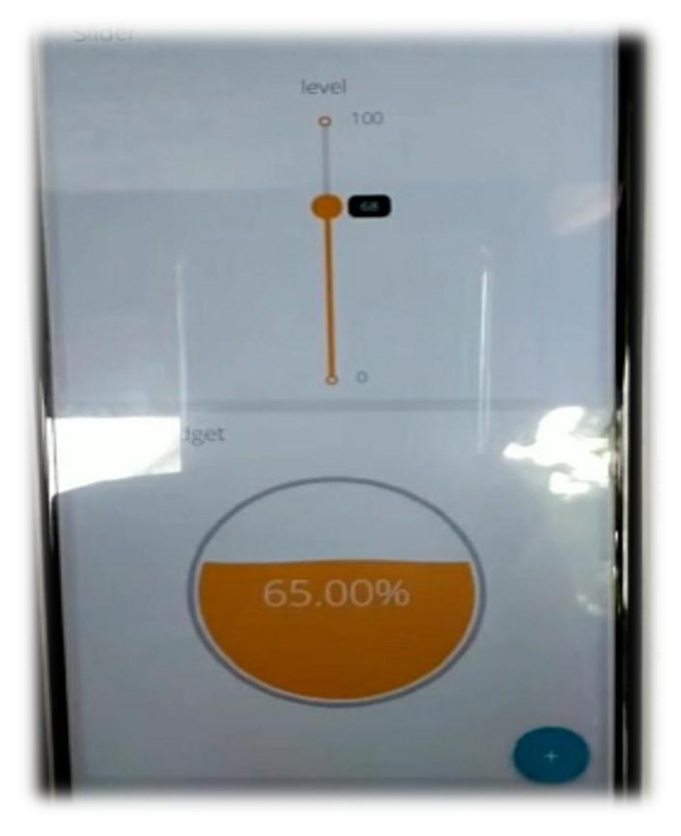
Fig3.Final Output On Mobile