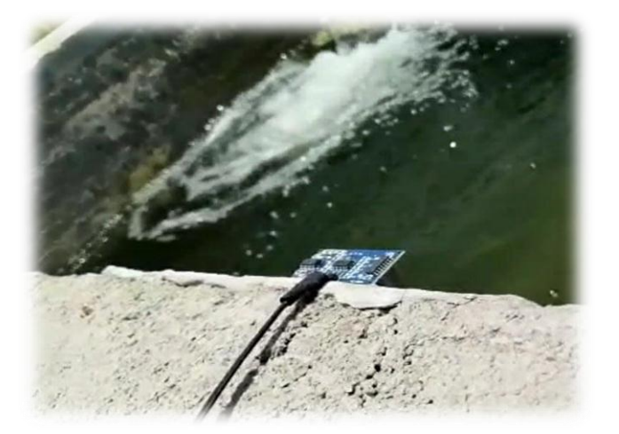
Fig2.Final Setup of Project