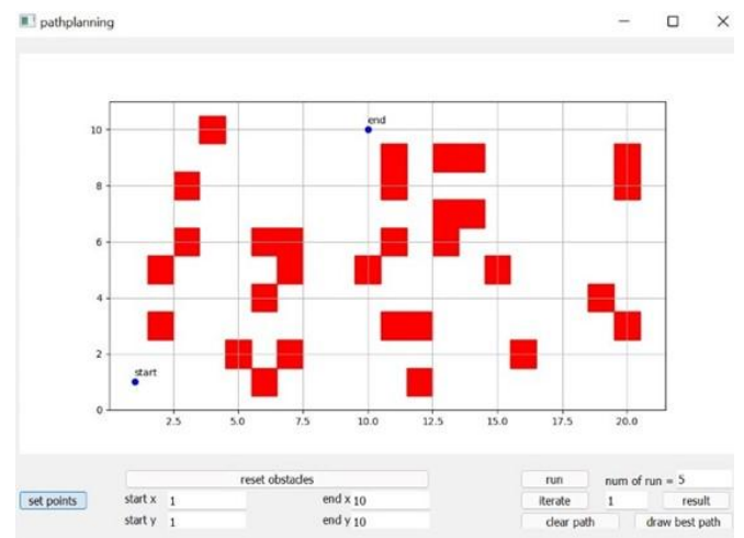
Figure -4: Setting source, obstacles, and destination points

Created a grid graph within the search environment(Figure 3). As a result, the robot will travel during a step pattern on the proposed grid, even as it might in the real world. In the aspect of stationing the obstacles and running the genetic algorithm with user input iterations, this work is made differently where static obstacles are stationed but reset obstacles(Figure 4) will change the positions of the obstacles. Assures that the goal position is the globally minimum path towards the full potential. During this work, anytime the obstacles keep changing the positions.