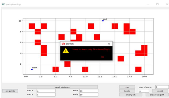
Figure -1: Validation of inputs