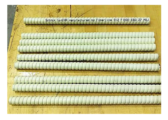
Fig. 2 GFRP Bar.

Reinforced concrete is very commonly use material in the construction such as, road, airport construction, bridges, buildings etc. Due to increasing in demand of reinforced concrete. Corrosion in reinforcement is mostly causes in buildings. Therefore, the application of any other materials which replace the steel can considered as important alternative. Now, Glass fiber reinforced polymer bars is promising and very effective replacement for steel which increase life of reinforcedconcrete structures exposed to severely environment. Glass Fiber Reinforced Plastic rebar is provided good results in corrosion resistance. GFRP bars are composed of glass fibers with a thermosetting resin and procced using a pultrusion process. Its advantages include high stiffness to weight ratio, high longitudinal strength, tensile strength, corrosion resistance and light weight, resist chemical attack and electromagnetic neutrality for this reason we are using GFRP bar in this excrement.