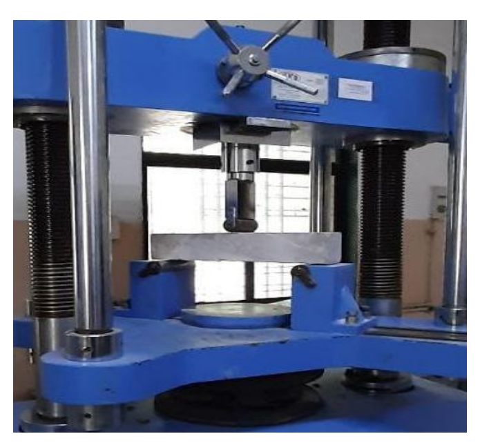
Fig 5. Graph of UTM Machine

The result obtains for this experiment the beams contain 8mm TMT bar and 0% PCA (Mix 1 in table) test results include crack initiation load and the corresponding deflection. the average crack imitation load is 18.80KN and corresponding deflection 5mm on 7 days testing. then after 28 Days the average crack imitation load for the beams is 27.50KN and average deflection is 5.50 mm.