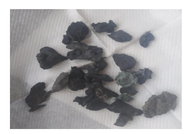
Fig. 1 plastic coarse aggregate