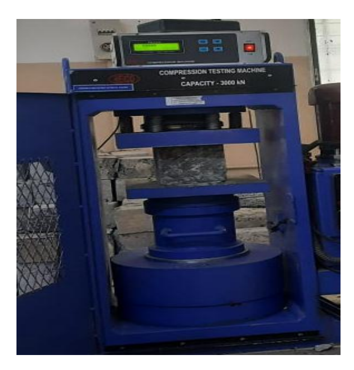
Fig 3. Compression Testing Machin

The permissible error for calibration of testing machine shall be not greater than \pm 2\% of the maximum load. The specimen shall be placed in the machine in such a way that the load can applied to opposite sides of the cubes, as a same time not to the top and bottom and is shown in Fig. 3. The axis of the specimen shall be carefully arranged with center of the seated late; no need packing between the faces of the test specimen and the steel plate of the testing machine. The load should apply without shock.