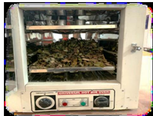
Fig -2: Oven drying of water hyacinth

The Water Hyacinth were taken and shredded into small pieces. The shredded samples were taken and dried in room temperature for 24 hours until the excess water in the sample had expelled. Then the sample was sun dried until the moisture content in the WH was removed and the sample acquires a homogeneous greenish color. It took 5 to 7 days depending on the sun light and heat produced. The sample was then oven heated for 24 hours at 200°C so that the moisture content was completely removed and gets stiffer for pulverizing. The sample was then pulverized and sieved in IS 90 microns. The sample was then heated in oven at 300 degrees Celsius for 8 hours. The color of the sample turned black and the WH Ash was formed which was non organic and inert material.