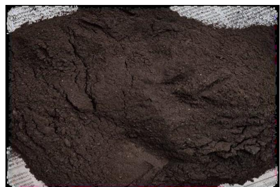
Fig -3: Water Hyacinth ash powder