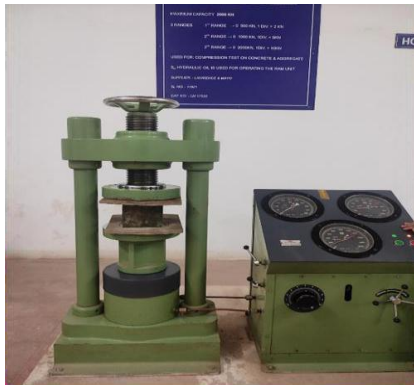
Fig -6: Compressive strength testing

These specimens are tested by compression testing machine after seven days activity or 28 days activity. Load ought to be applied bit by bit at the speed of 140 kg/cm 2 per minute until the Specimens fails. Load at the failure divided by space of specimen provides the compressive strength of concrete.