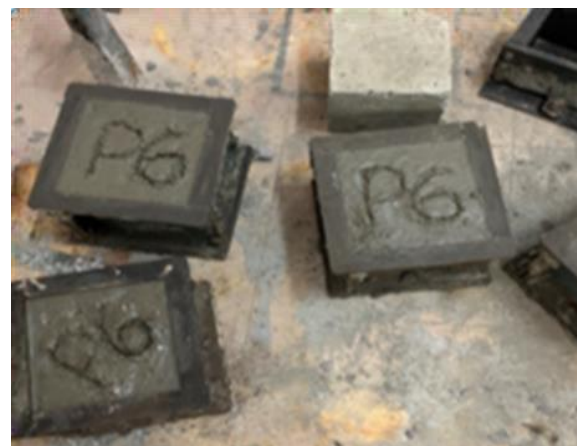
Fig -4: Casting of concrete

The concrete mixes were prepared as a binary blended cement with 25% fly ash content and then containing different proportion of water hyacinth ash in various proportions the concrete were prepared through batching to create ternary blended cement. The selected materials were properly weighted and mixed as per the design mix proportion of 1:1.67:3.52 approximate to M25 grade concrete, the water cement ratio in the work is 0.44, which is obtained from IS 10262:2019.