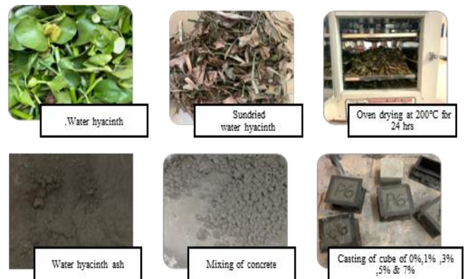
Fig -5: methodology of concrete