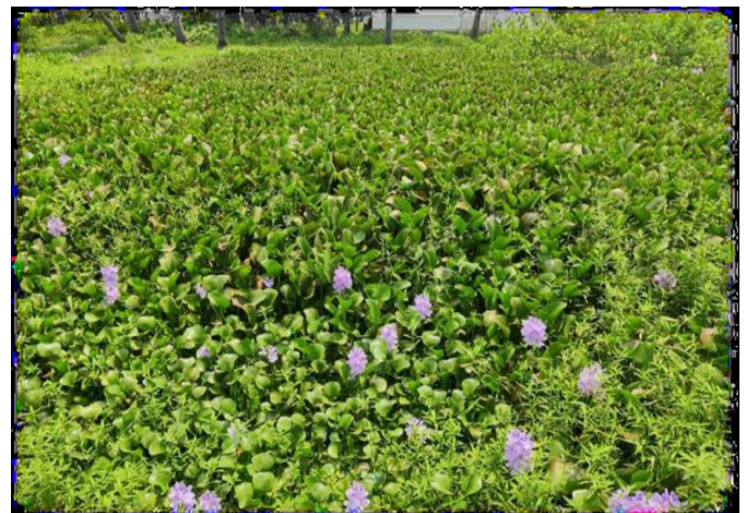
Fig -1: Water Hyacinth Plant

Large amount of carbon dioxide is released in the manufacture of cement which causes many environmental problems including global warming. Many locally available materials are being tested for substitute of building materials in part or full replacement which would result in cost reduction in construction works and preferably preserving the natural resources and make it environmentally friendly. This includes the locally available material like paper pulp, rice husk, silica fume, eggshell, ground nutshell, etc. the tests conducted with these materials have proven successful in all ways this supplementary material will come largely in use when the shortage of materials occurs and does not meet the needs of the construction industries.