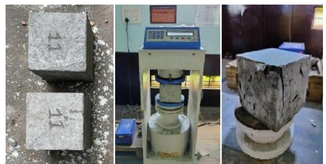
Fig-4: Compressive Strength Test of Cubes

7.1 Compressive Strength Test: The cubes were tested for compressive strength with respective ages of curing as 7, 14 and 28 days. A compressive strength test helps to determine concrete grading as shown in Fig-4.