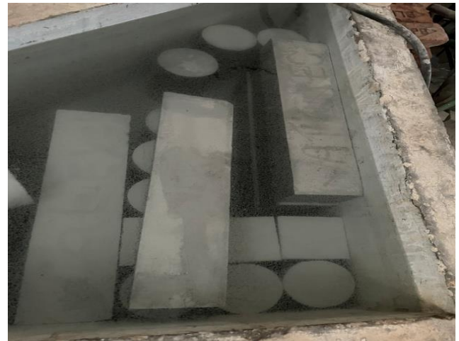
Fig-3: Concrete Specimens after De-moulding

A total 9 cubes, 9 cylinders and 9 beams were cast for the compressive strength test, split tensile strength test and flexural strength test respectively. The appropriate mix proportion was maintained during the construction. After 24 hours of casting, the specimens were de-moulded and submerged under the water for curing which is shown in Fig 3.