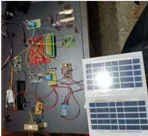
Fig; Green Charge; Managing Renewable energy in smart buildings

In this project, we examine how to lower electricity bills using Green Charge by storing low cost energy for use during high cost periods. Finally we analyze the green charge costs, the expected rise in electricity prices and decrease in solar panel prices may make Green Charge return on investment.