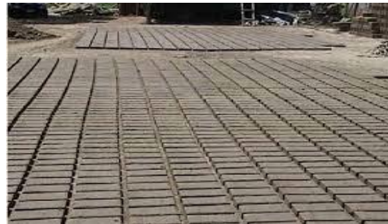
FIG 3.4 DRYING

Water was added during clay preparation to increase workability of the mixture, but in drying it is removed for several reasons. First, there will be less cracking in fired bricks with less water content. Second, additional fuel is needed, beyond what is used for firing, to dry the bricks in the kiln. Proper drying of bricks will involve rotating the bricks for different exposures to ensure even drying rates. For best results, drying should be done slowly. This will help with more even drying. Also, the best drying technique may change from location to location, so the brick makers must gain experience to determine the best way to dry bricks for each production process. We dry the bricks under the normal atmospheric temperature (25°C).