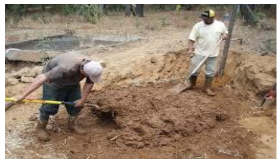
FIG 3.2 MIXING

In addition the rice husk, salt and lime was also added separately as well as combination of any rice husk-lime, salt-lime and salt-rice husk weight of the soil.up to 5% of total