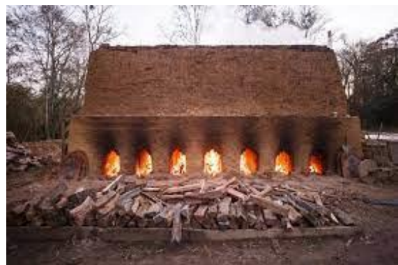
FIG 3.5 FIRING OF BRICKS

Finally, the process of firing the clamp will take place in several steps. First, pre- heating, or water-smoking, will remove the water leftover from the drying process. This process is still physical. The second stage is firing, where the clay bricks will vitrify through a chemical process. The temperature must remain constant at this stage for complete verifications. Finally, for the cooling stage, the temperature must be slow and steady. A clamp may take two weeks to cool.