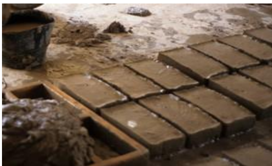
FIG 3.3 MOULDING

The size of a mould for brick making was selected such that considered shrinkage effect of soil take in mind. Bricks will shrink when drying, so the mould size chose larger than the intended finished brick. The slop moulding technique was adopted for the preparation of the mould. In slop moulding, a wet clay mixture is used- the mix is put into a rectangular form without a top or bottom. The mould was selected in size of 200mm x 100mm x 100mm height with a frog 10 to 20 mm deep on one of its flat side. The limitation with this technique is that because the mix is so wet, the brick may deform under its own weight and the surface can be marked easily. Moulded bricks can be imprinted with the brick manufacturer's name, called a "frog," on the flat side of the brick. This advertising, helps the brick dry and fire better, and is a good form of advertising.