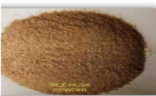
FIG 2.3 COAL POWDER

This is the powdered form of coal, which is created by crushing of coal. This is product obtained during mining. Coal powder is used in concrete. This is used to give stability to soil in brick manufacture.