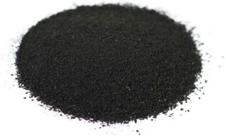
FIG 2.2 RICE HUSK POWDER