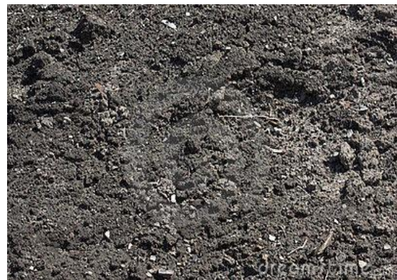
FIG 2.1 BLACK COTTON SOIL

Black cotton soil is a clayey type of soil also known as "Expansive soil". It has very low bearing capacity, high swelling and shrinkage characteristics. Hence stabilization is needed for this soil before subjecting it to any construction purpose.