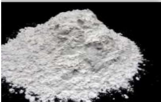
FIG 2.4 LIME POWDER

Lime powder is obtained by calcification of limestone. It has cementing capability. It can be used in concrete as cementitious material. Lime is used in manufacture of cement. Lime powder enhances the strength of the black cotton soil.