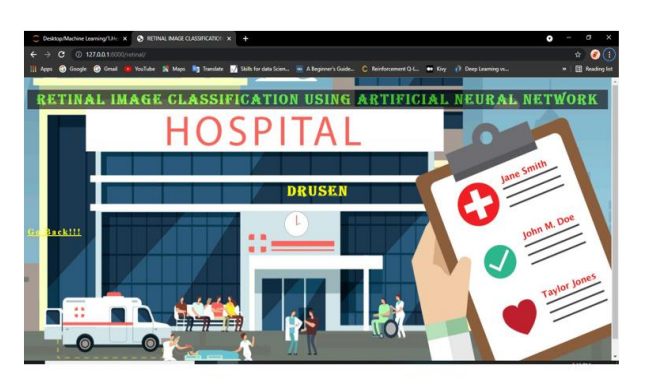
FIGURE 1 : INPUT