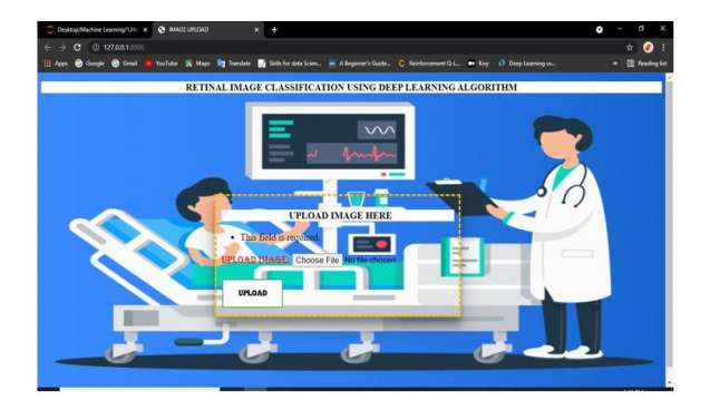
FIGURE 2: OUTPUT